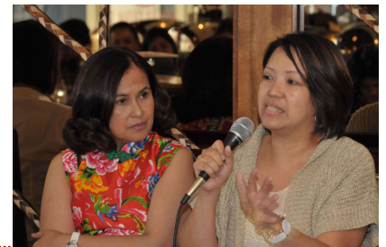
ENGAGING PANEL SHARING